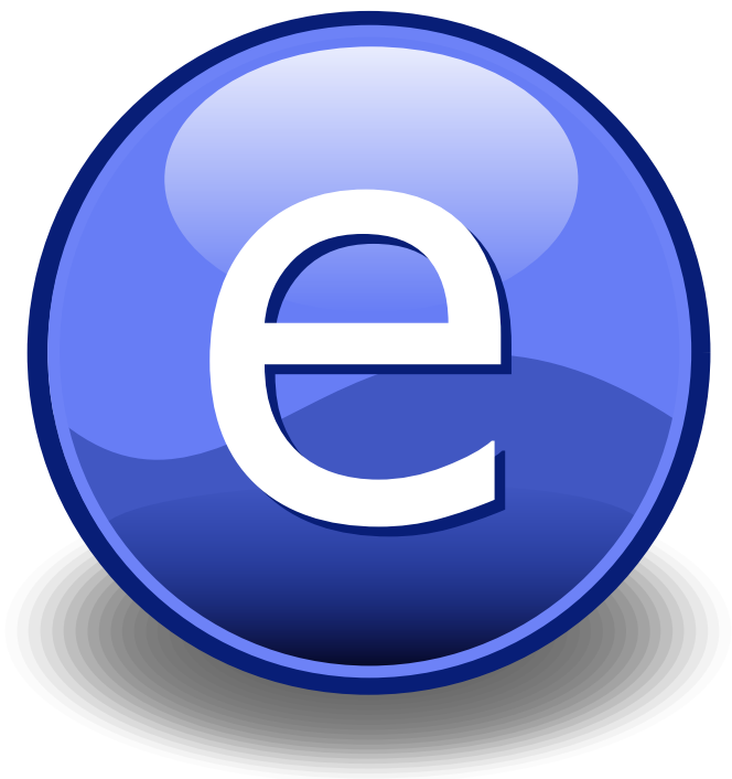
FIGURE C.1: An electron (artist's impression).

Also look in the source file. Putting this code into the source file produces the picture of the electron that you can see in the figure below.